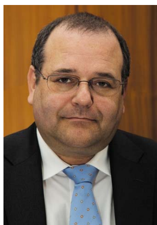
Olegario Vázquez Raña ISSF President